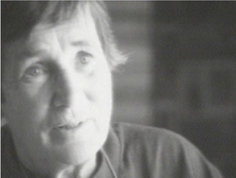
Agnes Martin 1976: An Interview , 1976

Instituto Valenciano de Arte Moderno Centre Julio Gonzalez in Valencia, Spain, and to the Center for North American Studies in Barcelona, Spain in 1989, before appearing in Central Park's Summerstage Program in New York City in 1990. A final iteration of the Video Drive-In was staged in Grant Park in 1992.]